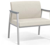
JEC131-OA 31" Guest Chair