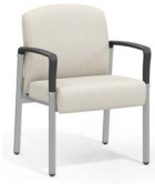
NTG110-WA 21" Guest Chair