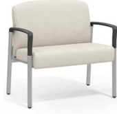
NTB120-WA 31" Guest Chair