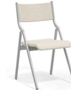
KT400 16" Folding Chair