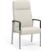
NTP130 21" Highback Chair