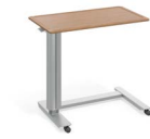
ST200C Overbed Table, C-base