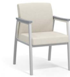
JEC121-OA 21" Guest Chair