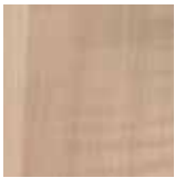
Hardrock Maple (HM)