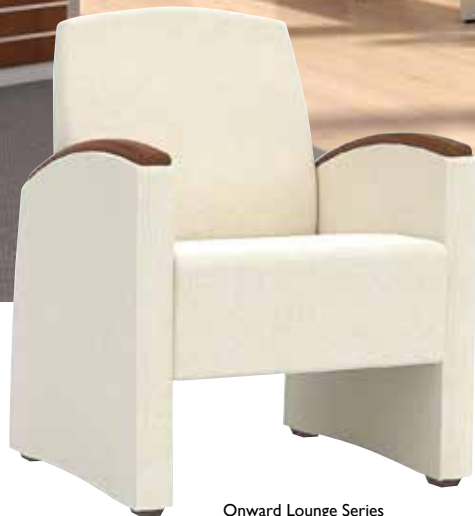
Onward Lounge Series

Coordinate related products to design your perfect space!