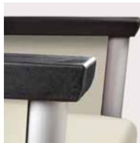
Available with optional polyurethane armcaps (black only)