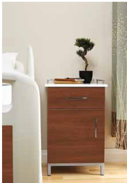
Drawer/door bedside on 4-leg base Shown with solid surface top and galley rails