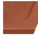
Spill Top (TSP)