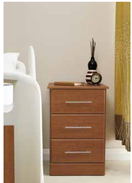
3-Drawer bedside Shown with closed kick