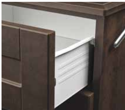
Powder-coated steel drawer sides covered by lifetime warranty