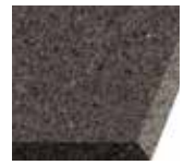
Solid Surface (TSS)