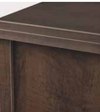
Solid matching backs provide superior structural integrity