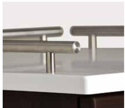
Many top styles and options available. Solid surface top with galley rails shown here