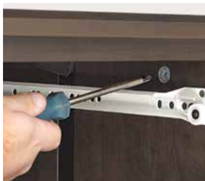
K-D fasteners allow tops to be easily replaced in the field. Doors and drawer fronts are also field-replaceable