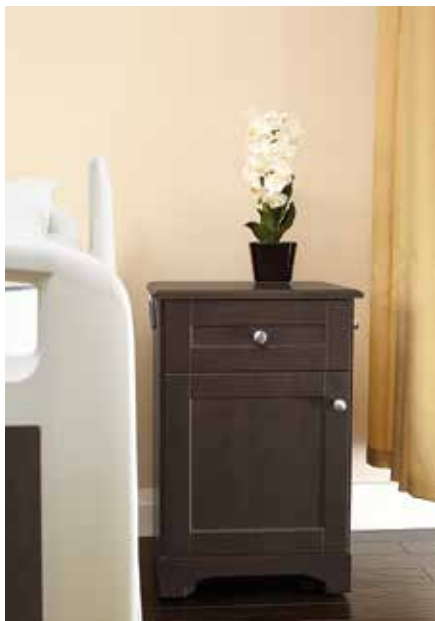
Drawer/door bedside Shown with self-locking caster system

Make your patient rooms safer and easier to clean, with our new self-locking bedside cabinet feature. Simply squeeze the lever to effortlessly roll the cabinet wherever it needs to go!