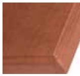
Santa Fe (TS)