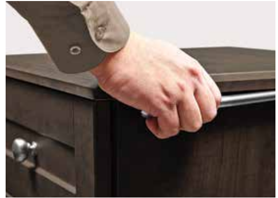
Optional self-locking caster system allows cabinet to be moved safely and easily

Make your patient rooms safer and easier to clean, with our new self-locking bedside cabinet feature. Simply squeeze the lever to effortlessly roll the cabinet wherever it needs to go!