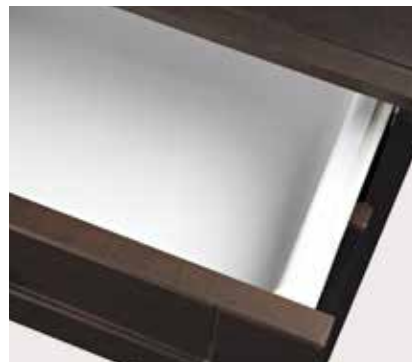
Optional drawer liner for bedside cabinet models is removable for cleaning purposes