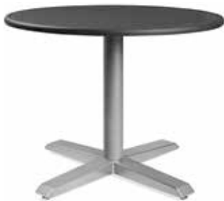
Dignity Series - Fixed-height table