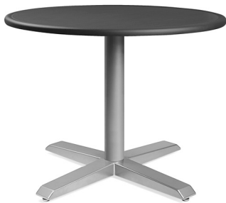
Dignity Series - Fixed-height table