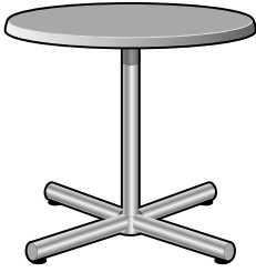
Table with tubular X-base. Standard 29" height