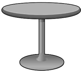
Table with trumpet base. Standard 29" height