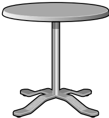
Table with raised flatbar X-base. Standard 29" height