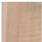
Hardrock Maple (HM)