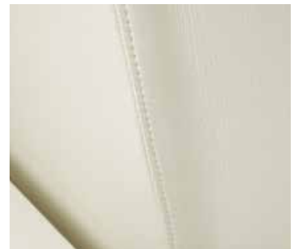
Stitching method reduces seams for increased infection resistance