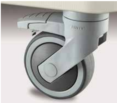
4 locking casters prohibit wheel from rolling or swiveling for increased patient safety