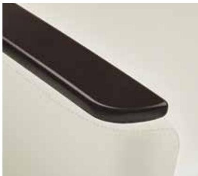
Optional arm caps available in wood, polyurethane and solid surface