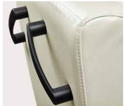
Ergonomically-positioned push handles for patient transport