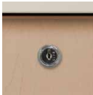
Optional drawer lock may be specified on any Royale cabinet