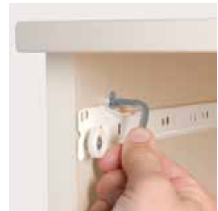
K-D fasteners allow tops to be easily replaced in the field