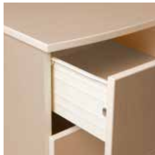
Powder-coated steel drawer sides covered by lifetime warranty