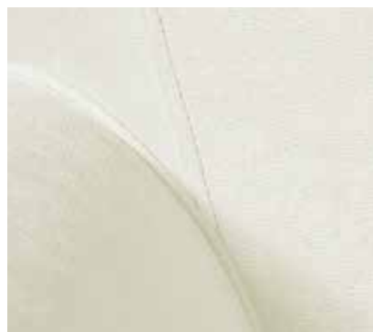
Attention to detail is evident in the superb craftsmanship