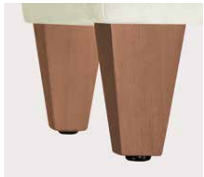
Tapered leg available in wood or metal. Both styles are field-replacable