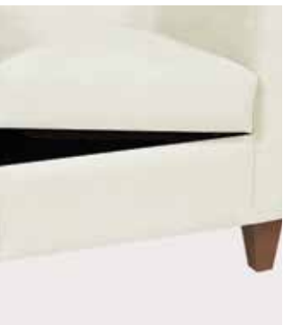
Seat cushion fits snugly yet is easily removed for cleaning