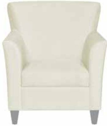
Front view Shown with metal legs in silver finish

Three-seat sofa W 75 D 32 H 37.5 Seat H 18.5 Seat W 63