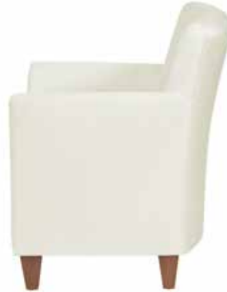
Side view Shown with wood legs in candlelight finish