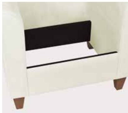
"Flow-through" design eliminates entrapment of dirt