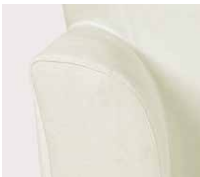
Unique, transitional style creates modern wingback appeal