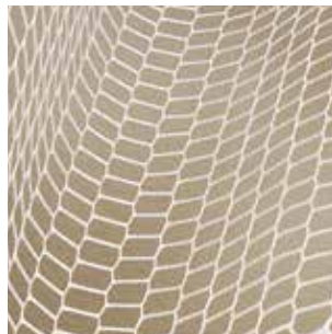
Standard nylon webbing ensures strength, ventilation and light flow