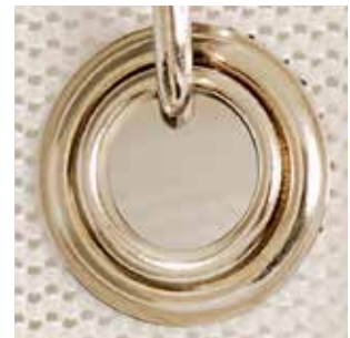
Durable, rust-resistant grommets