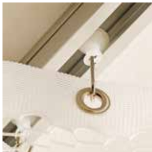
Simple but functional track and carrier design