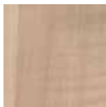
Hardrock Maple (HM)