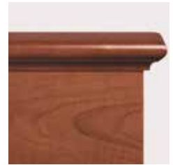
Head/Foot Boards feature solid maple decorative top rail