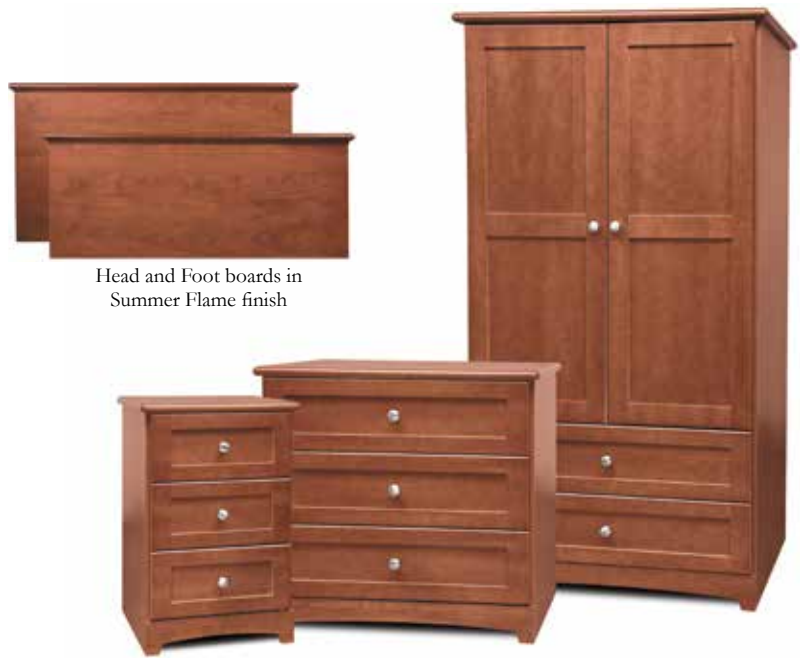
Head and Foot boards in Summer Flame finish

Doors and drawer fronts feature solid maple "frames" with 1/4" thick veneer insert panel. Cabinet sides and back sides are 3/4" thickness, surfaced with matching laminate.