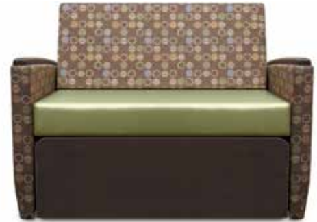
Laminate panel Model No. SL800