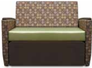
2 person sofa