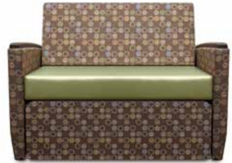
Fully upholstered Model No. SL820-UPH