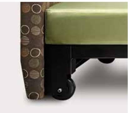
Boasts ultra-durable steel frame construction and long lasting neoprene wheels