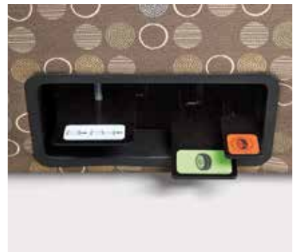
Easy-access foot activators allow ease of mobility and eliminate care-giver strain