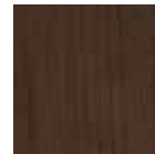
Cherry Blossom (CB)