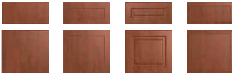
High pressure laminate with 3mm edging (HPL) Thermofoil Shaker (THS) Thermofoil Traditional (THT) Thermofoil Ainsley (THA)