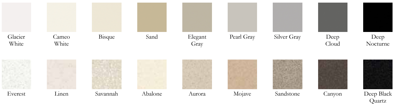
Glacier White Cameo White Bisque Sand Elegant Gray Pearl Gray Silver Gray Deep Cloud Deep Nocturne Everest Linen Savannah Abalone Aurora Mojave Sandstone Canyon Deep Black Quartz

* For a full list of high pressure laminate colours, please visit stancehealthcare.com/wilsonart