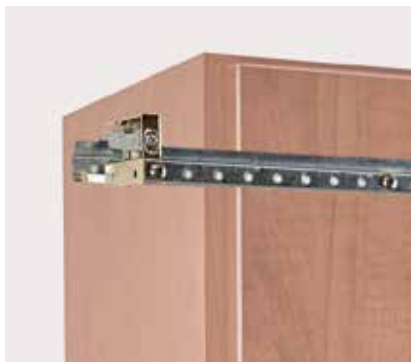
Cabinet hanging system enables fast and easy installation