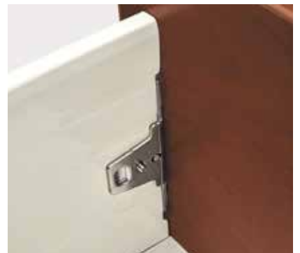
Steel drawer side construction provides increased durability