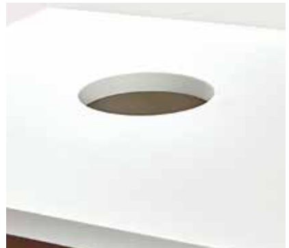
Optional waste cutout available in laminate and solid surface countertops