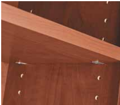
Optional shelving can be specified as fixed or adjustable