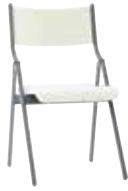
Kite Metal Folding Chair 16" seat width Model No. KT400 W 19 D 22 H 34 Seat H 18 Seat W 16 Weight 19