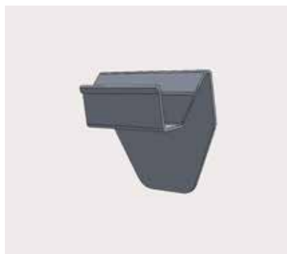
Bracket allows chair to mount tightly against the wall