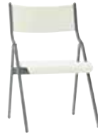
Kite Metal Folding Chair 18" seat width Model No. KT500 W 21 D 22 H 34 Seat H 18 Seat W 18 Weight 20