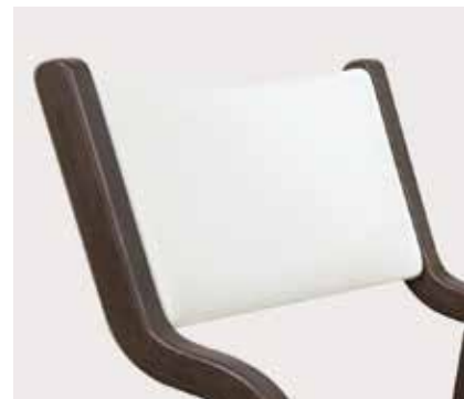
Contoured seat and back cushions provide ergonomic comfort