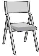
Kite Folding Chair with upholstered back Model No. KT300-UPB W 19 D 22.75 H 32 Seat H 18 Seat W 16.25 Weight 16