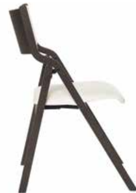
Kite folding chair (side view) shown in Enviro Leather Cactus fabric, with Chocolate finish