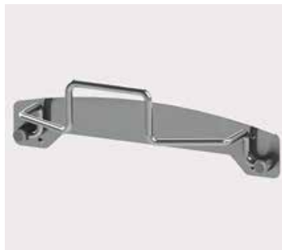
Bracket allows chair to store tight against the wall. Two designs available