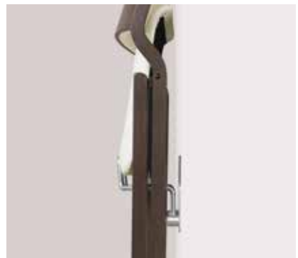
Stored chair depth is less than 7 inches