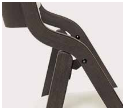
Frame design eliminates pinch points and risk of chair folding unintentionally