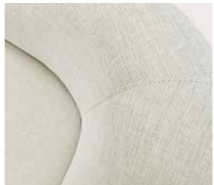
Attention to detail is evident in superb craftsmanship