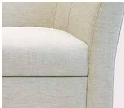
Seat cover features seamless front for increased durability