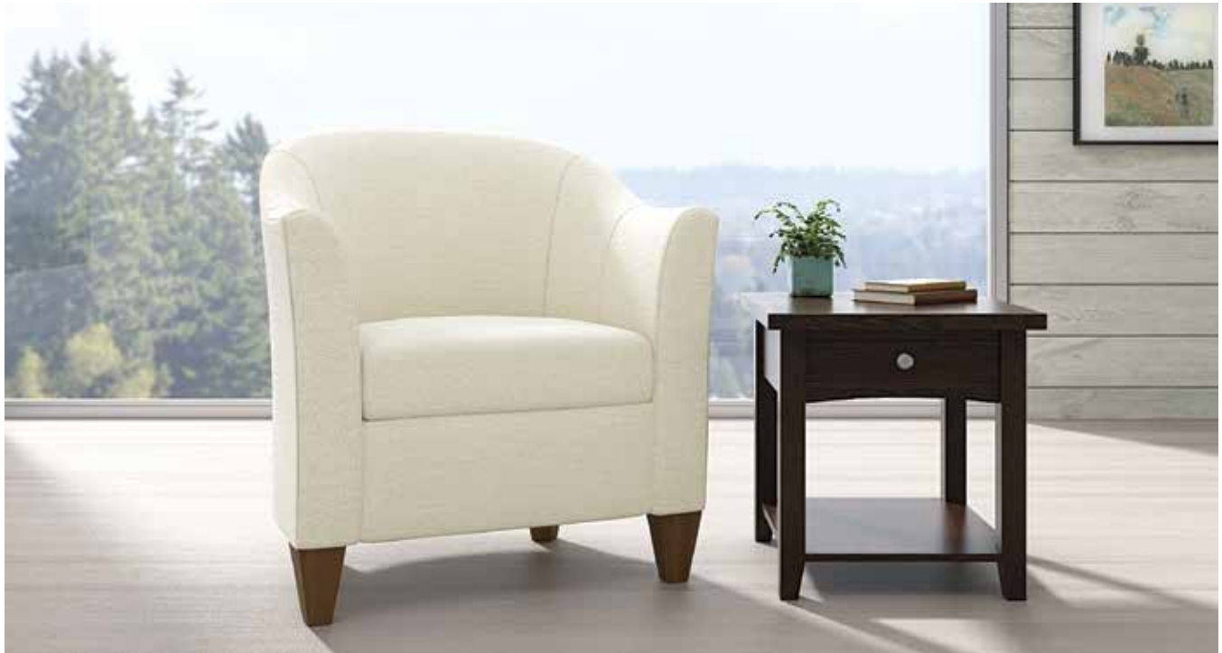
Charleston chair with Rustic Cherry leg finish

Tub chair W 31 D 28 H 31.5 Seat H 18 Seat W 20