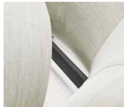
Removable seat deck enables ease of cleaning