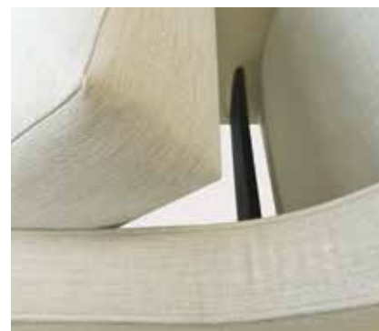
Removable seat deck enables ease of cleaning