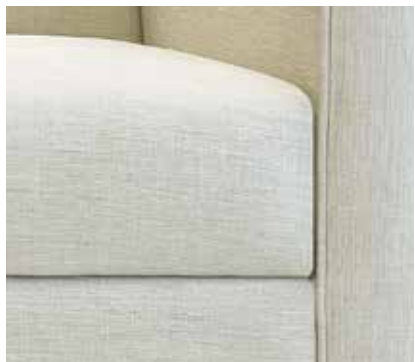
Seat cover features seamless front for increased durability