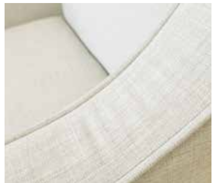
Attention to detail is evident in superb craftsmanship