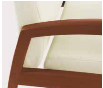
Separate seat and back for easy cleaning