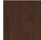
Cherry Blossom (CB)