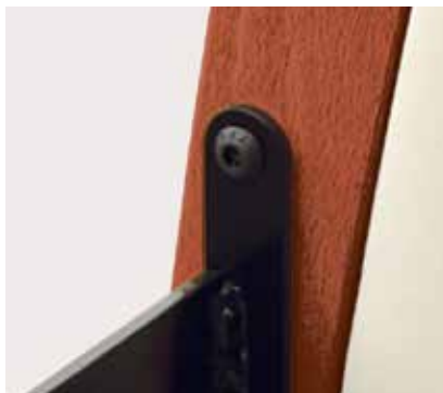
Tamper-resistant fasteners secured to metal inserts