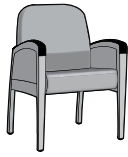
Heavy-Duty Guest chair