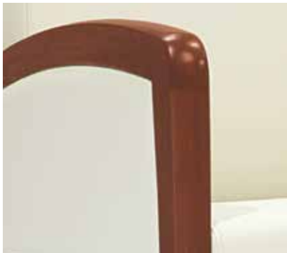
Closed arm panel available in upholstery or laminate