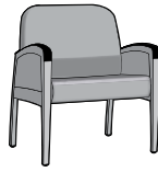
Heavy-Duty Bariatric chair