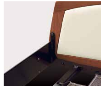
Inner steel seat frame adds weight and durability