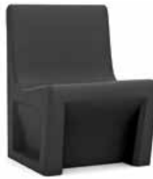
Empire Armless Shown in black finish