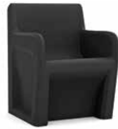
Empire with arms Shown in black finish