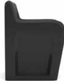
Empire with arms - side view