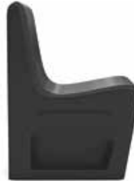
Empire Armless - side view